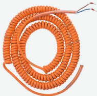
Coiled grounding cable up to 15 m