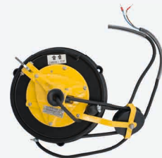
Cable reel up to 10 m