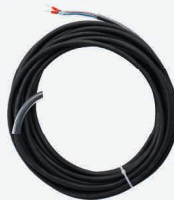
Straight grounding cable up to 30 m